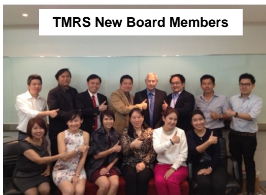
TMRS New Board Members